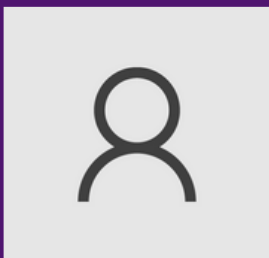
Director of Human Resources